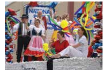
The colorful National Polka Festival parade is a crowd favorite each May.

Ennis is very proud of its multicultural heritage and the events that celebrate its diversity! There is one special weekend that celebrates Ennis' Czech heritage to the hilt. Each Memorial Day weekend, people come from far and wide to take in the sights, sounds, tastes and smells served up three days straight at the National Polka Festival. Enjoy Czech tradition at its best from polka dancing downtown and at the three dance halls to music, polka mass, kolaches, and crafts. A colorful parade highlights the festivities. Every Christmas season, the festive "Lights of Ennis" adorn the downtown district. Holiday activities include the Christmas Parade of Lights and Block Party!